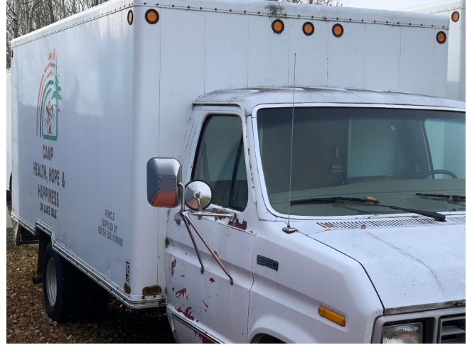
The old cube van that is being replaced due to the generosity of the ACT/UCT #1016 Edmonton and the Kiwanis Club of Edmonton Downtown.

The kindness of this group is evident from their work in the community and their steadfast commitment to camp. This generous group has contributed over $700,000 to camp over the last 24 years. Thank you ACT / UCT #1016 your gift and dedication to camp is greatly appreciated.