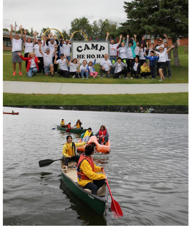
Suncore Staff and family members spent a day giving back to campers through the Suncor SunCares Program. They assisted in program activities and saw the value of what we do here at Camp He Ho Ha.

Suncor has continued to make gifts through a pledge to one of our Archery Participants for the last 10 years, with over $10,000 donated over that time.