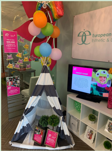
Open House for Camp He Ho Ha at European Institute of Esthetics MediSpa and Training Centre on July 17, 2019.