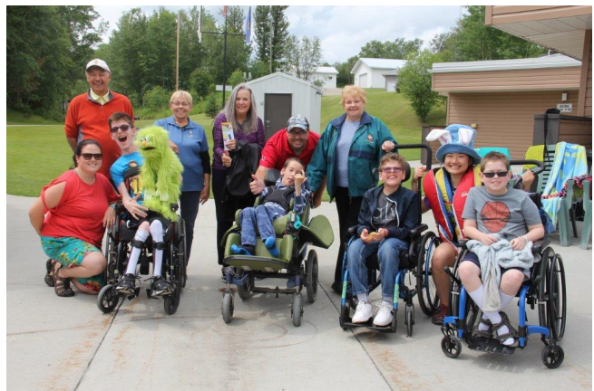
Members of the ACT/UCT #1021 Red Deer Club along with Camp He Ho Ha counselors and campers from the Teens and Children with physical disabilities camp.

This photo tells the story of what it means to give to Camp He Ho Ha - generous members of the ACT/UCT #1021 Red Deer Club, happy campers and two beaming staff! This Red Deer Club has been supporting camp for many, many years, and this year was no exception. Several members visited camp during the summer, and presented a wonderful donation of $3,500! Camp is so grateful for the generosity of the ACT/UCT #1021 Red Deer Club.