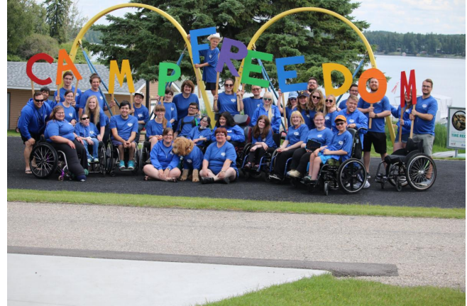
Campers and Staff from the Spina Bifida and Hydrocephalus Association of Northern Alberta, 'Camp Freedom' at Camp He Ho Ha August 4 – 7, 2019.

Thank you so much to our friends at the Spina Bifida & Hydrocephalus Association of Northern Alberta for choosing Camp as your facility of choice.