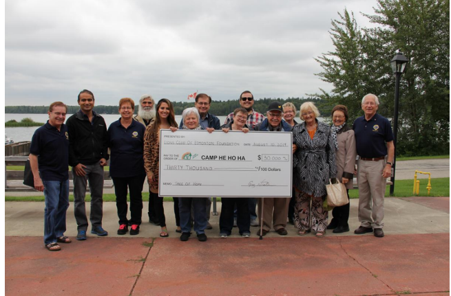
Members from the Edmonton Host Lions Club with an exceptionally Generous Donation of $30,000 for Camp He Ho Ha.

Since 2002, this foundation has donated a very impressive $420,000 to sponsor children and adults to attend Camp's adapted recreational programs! Words are not adequate to express our gratitude for the dedication, encouragement, support and generosity over the many years! Take pride in knowing that you make dreams come true and make a huge difference in hundreds of lives each year!