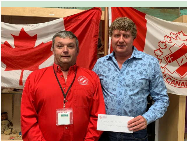
Representatives from the Stony Plain Kinsmen invited Camp He Ho Ha to their meeting on October 2, 2019 where Camp was honored to receive funding.

Your efforts and generosity make the difference for hundreds of individuals with disabilities every year. Thank you for your continued partnership!