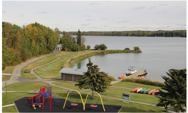
Camp He Ho Ha Facility NE Waterfront View

All of the Staff at Camp work diligently to provide a friendly, inviting, and productive environment for our guests. Customer satisfaction ensures our standard of service is upheld --- reviews are welcomed and suggestions regarding the facility, staff and service are taken seriously. Rental groups complete a survey that allows both participants and organizers the opportunity for anonymous feedback, which in turn, assists Camp in ensuring a continued level of excellence we can all be very proud of.