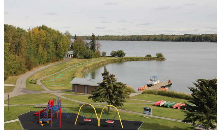
Camp He Ho Ha Facility NE Waterfront View

Camp continued to welcome a wide variety of groups accessing all areas of the facility for retreats, church gatherings, seminars, scrapbooking & quilting retreats and much, much more. With over 1,800 individuals in attendance, the rental program generated over $454,000,