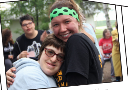
Book your next meeting, gathering, or retreat at Camp He Ho Ha and experience our amazing service.