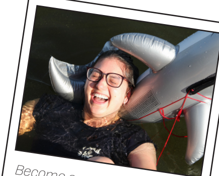
Become a member and get the latest news on Camp through our quarterly newsletter.