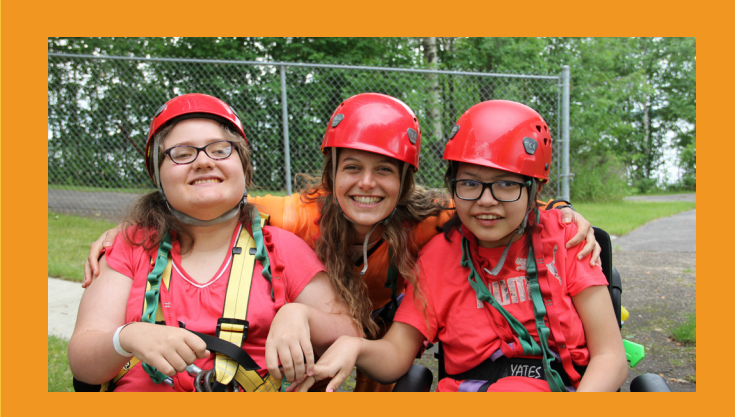
...for children and adults living with physical and mental disabilities...